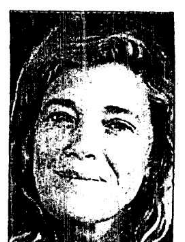
Actress and photographer Berry Berenson.