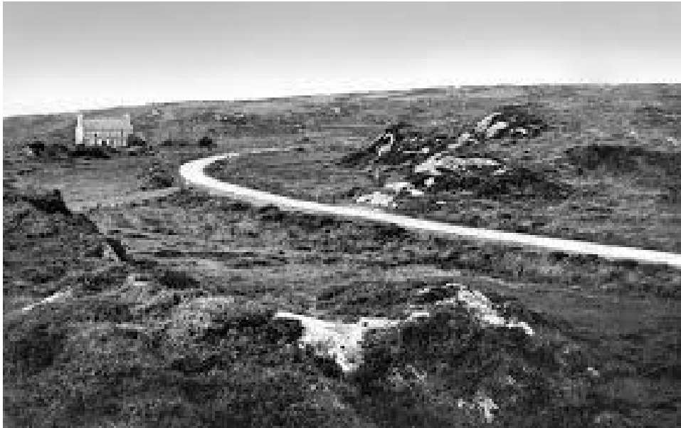
Picture of the ambush site