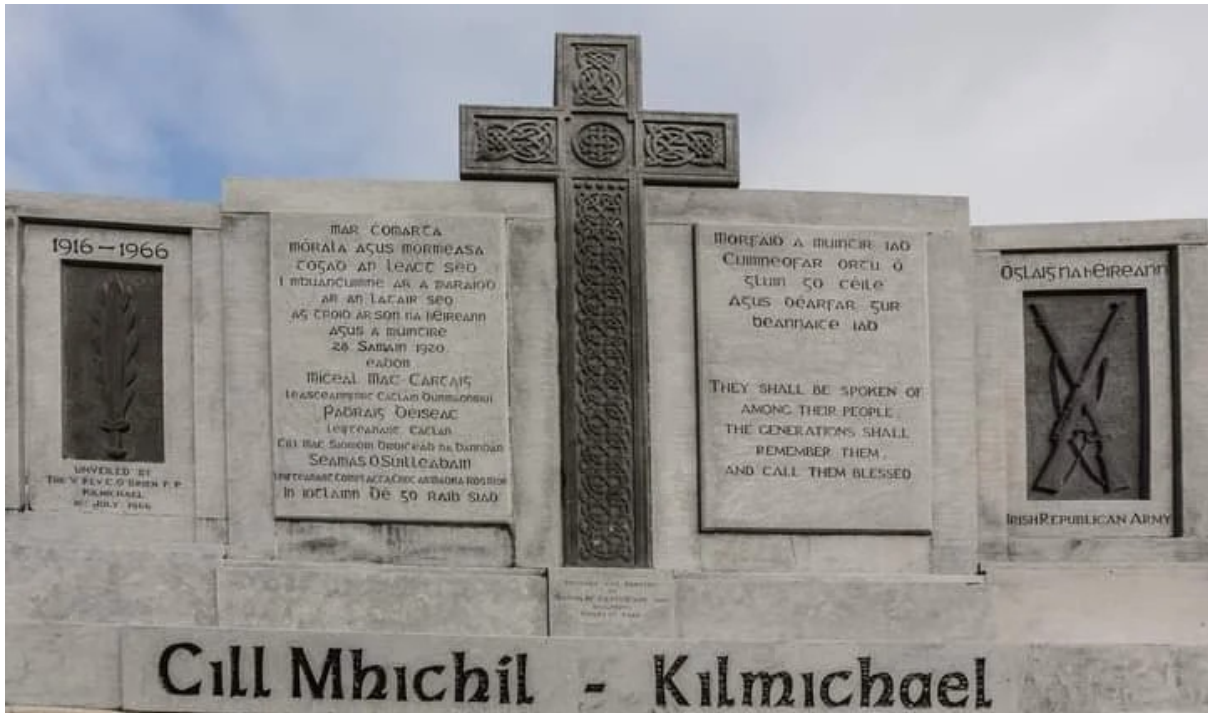
Monument at Kilmichael