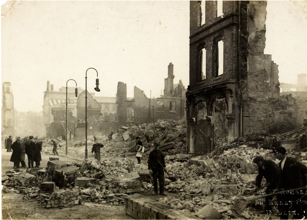
Destruction caused by the Burning of Cork