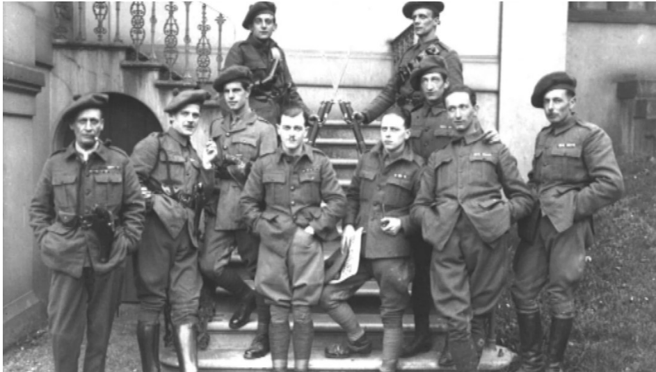
A group of Auxiliaries in Ireland during the War of Independence