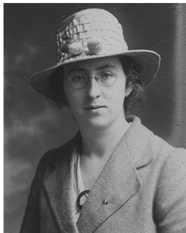
Margaret Skinnider in Glasgow, c. 1914

“SCOTLAND IS MY HOME, BUT IRELAND MY COUNTRY.”