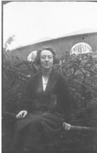
Skinnider in the North Dublin Union, c. 1923

Skinnider returned to Dublin in April 1919, two months after the start of the War of Independence. She participated in the War of Independence with the Fairview branch of Cumann na mBan, organising first aid training, providing support to the dependents of imprisoned IRA members, going on raids for firearms and giving shelter to people on the run. At the war's end, she was dissatisfied by the Anglo-Irish treaty and was an active militant during the bombardment of the Four Courts, where she operated as a courier for top ranking Irregulars such as Liam Mellows and Cathal Brugha. After the death of Harry Boland, she took over his post as the quartermaster general, becoming the only woman to hold such a high rank in the IRA. On Christmas Day, 1922, Skinnider was arrested by the provisional government for being in possession of a revolver and was imprisoned in Mountjoy Jail. She and eleven other Republican women imprisoned in Mountjoy went on hunger strike to protest the deteriorating conditions in the jail and after twelve days of fasting, they were all transferred to North Dublin Union. She was released from prison in November 1923, six months after the end of the Irish Civil war.