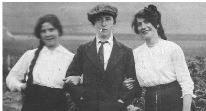
Margaret Skinnider (middle) wearing men's clothes. Skinnider wrote that Countess Markievicz once dressed her in a Fianna Éireann uniform to see if she could pass for a boy. c. 1916

Countess Markievicz first became aware of Skinnider on a trip to Glasgow, and she invited Skinnider to Dublin in the December of 1915. Skinnider crossed the Irish Sea on a mailboat at night, carrying detonators for bombs in her hat, the wires wound around her body, underneath her coat. Arriving in Dublin, she lodged with Countess Markievicz in her home on Leinster Road. Due to her knowledge of maths and calculus, she was requested by the Countess to draw up a map of the Beggar's Barracks in case it was necessary for them to be destroyed, a task that two Irish Volunteer officers had earlier failed to complete.