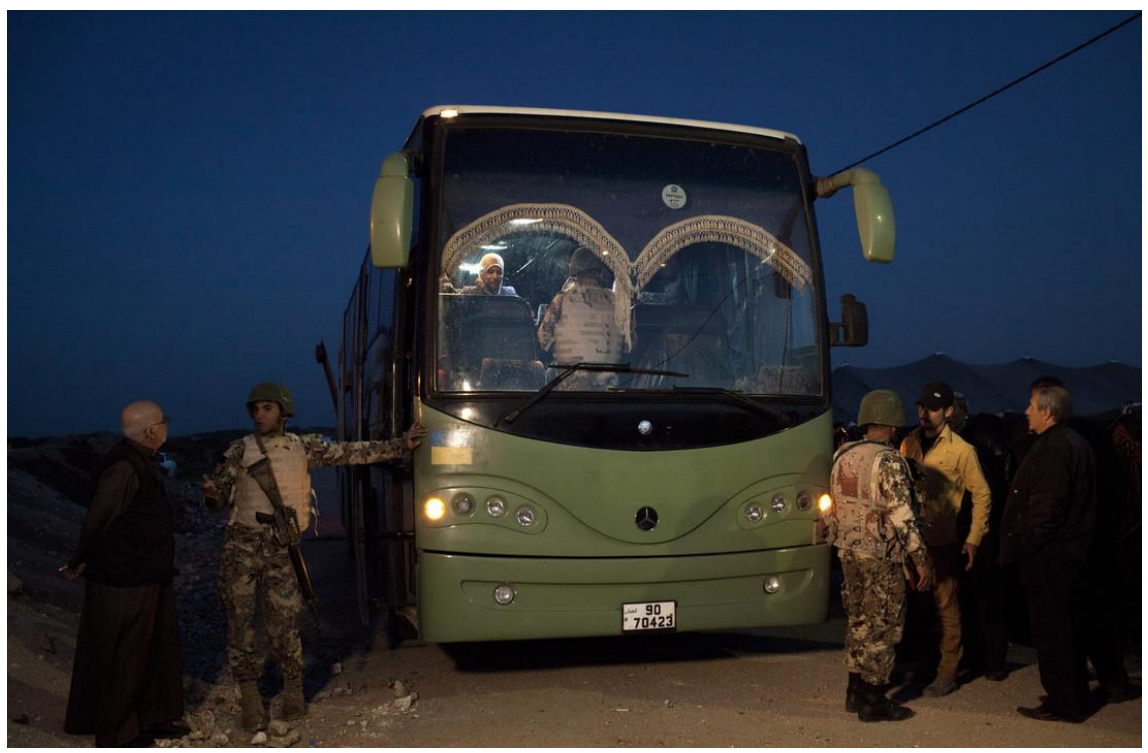
Refugees arriving at Syria's border with Jordan are bussed to Za'atari camp