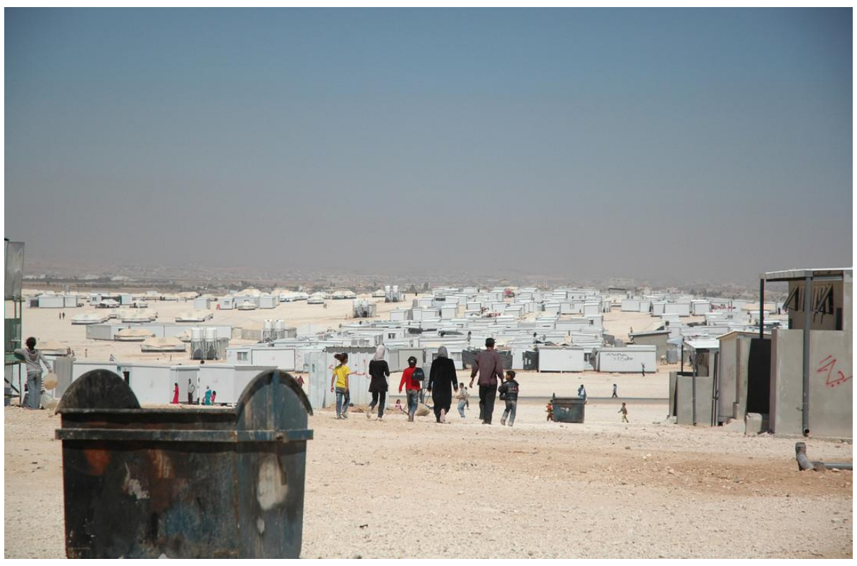
Za'atari refugee camp, Jordan

By mid 2013 approximately one million Syrian refugees had moved to Lebanon and Jordan, adding significantly to both countries' small populations and threatening their already strained public services and social order. Large numbers of refugees have also moved to Turkey, Iraq and countries beyond. However, this resource focuses on refugees' experiences in Lebanon and Jordan and contrasts the experiences of large numbers of these refugees; settling in host communities in Lebanon and moving to refugee camps in Jordan.