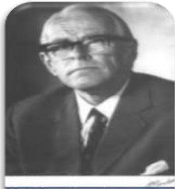
Denis Parsons Burkitt