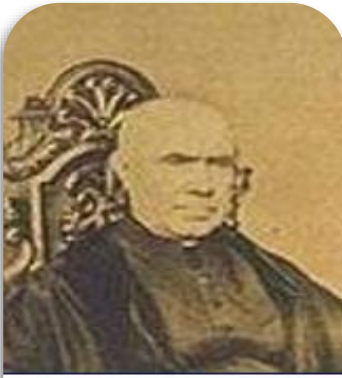
Rev. Nicholas Callan