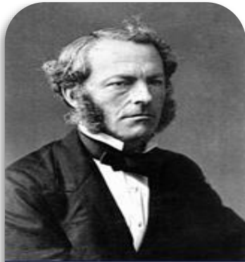
George Gabriel Stokes