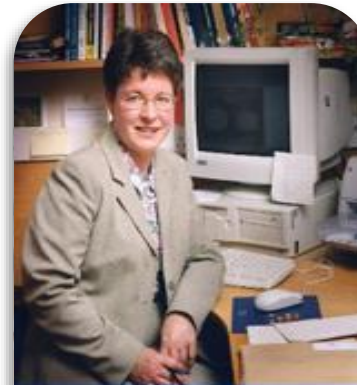
Jocelyn Bell Burnell