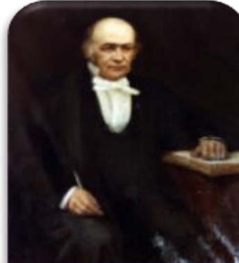
William Rowan Hamilton