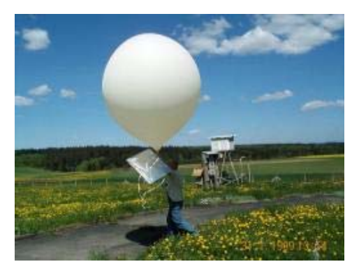
Weather Balloon being launched

It carries various weather instruments, and travels high into the sky recording the state of the atmosphere at different levels.