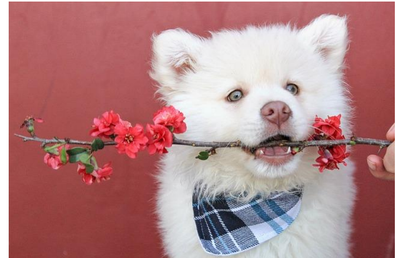
Young Dog – Puppy