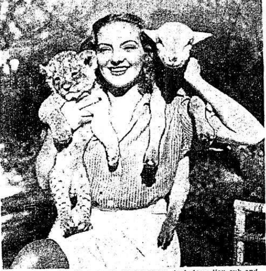
Young Columbia film player, Evelyn Keyes, includes a lion cub a lamb amongst her many pets.