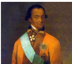
Anton Wilhem Amo

To what extent do you think circumstances impact identity? Other than circumstance what other factors contribute to who we are as individuals.