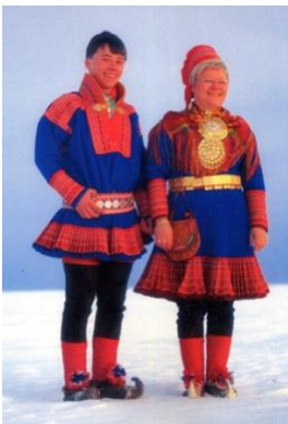
Sámi people of Northern Norway