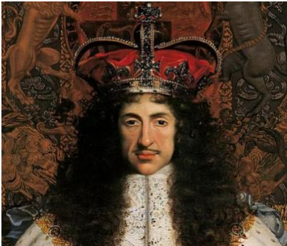
King Charles II 1630-1685

King Charles II was king at the time that Locke was writing. Who were The Whigs and what were their political beliefs in relation to the King?