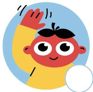
Raising a hand to ask questions