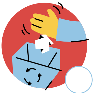
Throwing trash in the bin