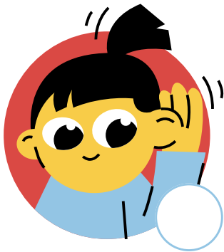
Listening during class

Which of these children are following the classroom rules? Give them stars for a job well done.