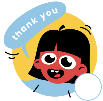
Saying "thank you."