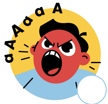
Screaming or yelling in class