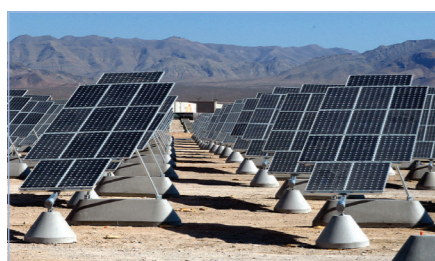
15 MW Solar power facility in Nevada, USA

Like hydro power, wind and solar power are renewable forms of energy. However, unlike hydro power, wind and solar power cannot be turned on just when required. They vary with the weather and time of day in sometimes unpredictable ways. Wind turbines typically require a minimum wind speed of around 10 km/h (3–4 m/s) and solar power cannot operate at night.