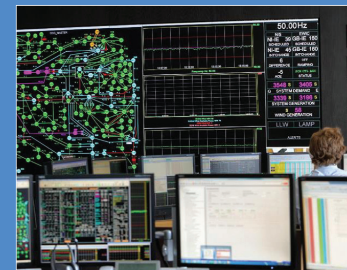
The EirGrid National Control Centre

You can find out more about the work of EirGrid at www.EirGrid.com