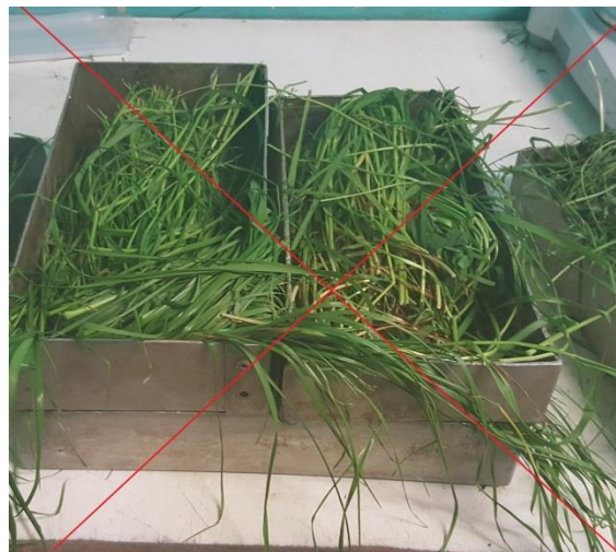
Figure 2: Poorly weighed/stored samples