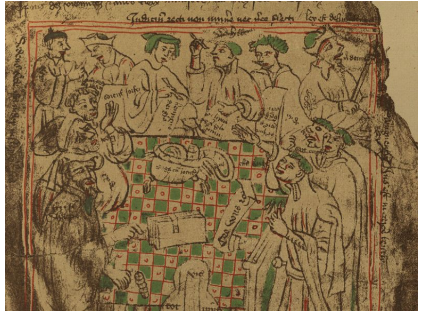
This illustration from the 15th century shows the Exchequer in action.