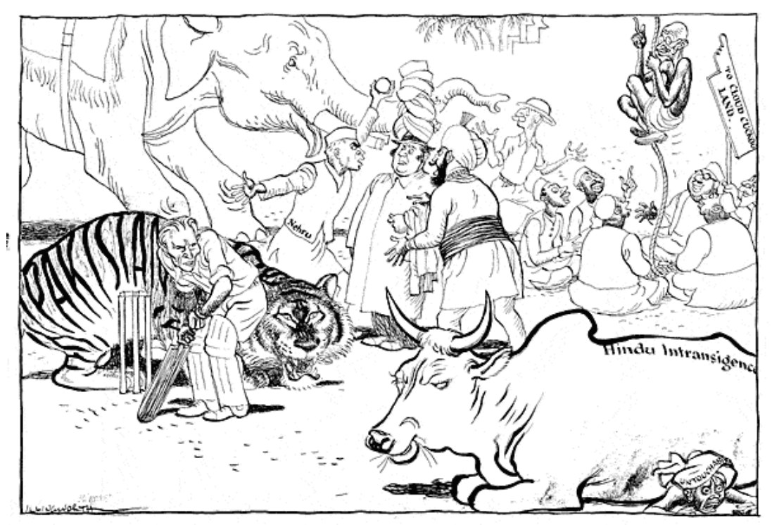
Indian politics, Daily Mail , 29<sup>th</sup> November, 1946.